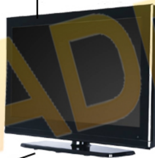
RECEIVER CONNECTED TO TV VIA HDMI CABLE